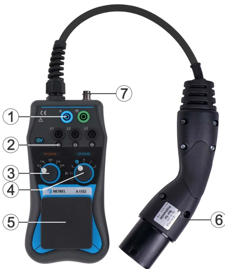
Figure 3.1: A 1532 components